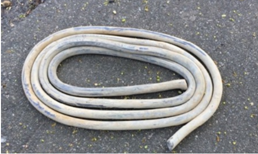
Lead Service Line